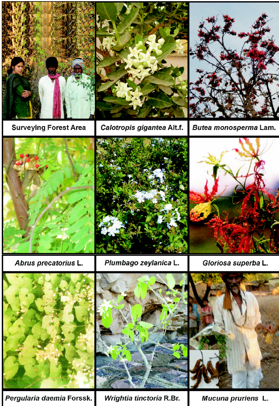
Medicinal Plants used for Birth Control