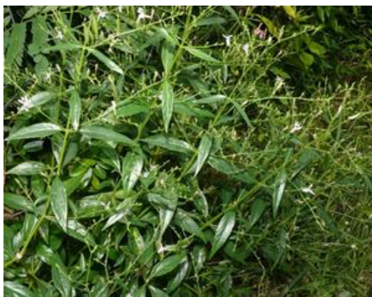
Fig. 1. Andrographis paniculata plant

The bitter principles in the leaves are due to the presence of andrographolide named Kalmegin, dioxyandrographolide, neoandrographolide and dihydroandrographolide isolated from the aerial parts. The leaves and stems are rich in flavonoids, gums, mucilages and tannins 18 . The medicinal value depends on the presence of chemical substance and their role in human body. The popular hepatoprotective Indian herbal drug Kalmegh (Andrographis paniculata) can be standardized by high pressure chromatographic determination of its major active constituents. The leaves of the herb were found to contain the highest amount (2.39% w/w) of Andrographolide and the seed to contain the lowest.