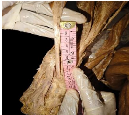
Fig. 2. The length of inter-tendinous slip

Legend-Figure [1]. Posterior view of the right forearm and hand demonstrating an intertendinous slip. The extensor compartment has been dissected to reveal a variant muscular/tendinous connection (arrow) originating from the extensor carpi radialis longus (ECRL) and inserting into the tendon of the extensor carpi radialis brevis (ECRB). Note the insertion points of the ECRL and ECRB on the second and third metacarpal bases, respectively.